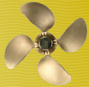
Varifold 4-Blade: up to 750 hp