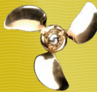
Varifold 3-Blade: up to 350 hp